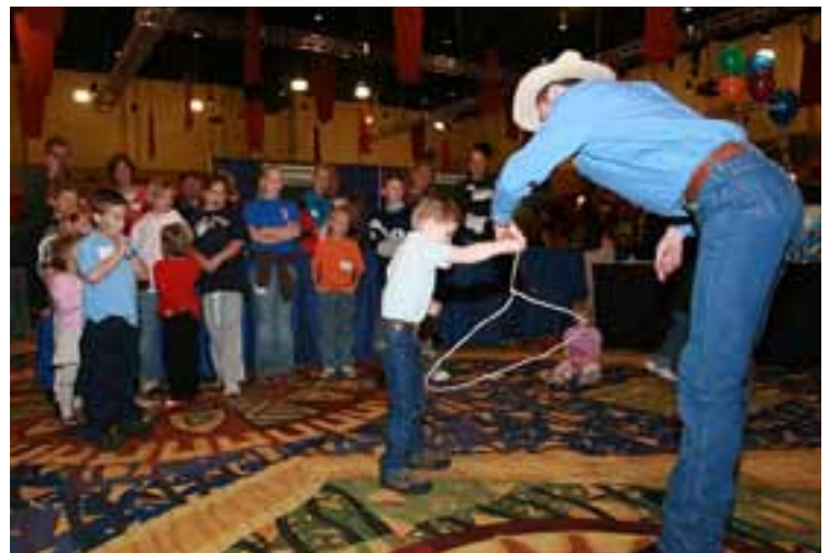
To supplement career fairs, the North Dakota Department of Commerce encouraged families to attend and incorporated local culture like this cowboy into its Experience North Dakota events, showcasing the state's unique culture to potential workers.

As importantly, economic developers need to recognize that talent attraction marketing, even more so than marketing to the businesses community, must have a local esprit de corps . Companies, citizens, and local economic development groups should be working in lock-step to promote the community and welcome in those who relocate. This may take a variety of forms, from including top companies in talent attraction events to an ambassador program that calls on former residents to serve as advocates for the community around the country. But regardless of the tactics, community buy-in is essential to presenting a community as an enviable place for job seekers to live and work and into which they'll be willingly assimilated.