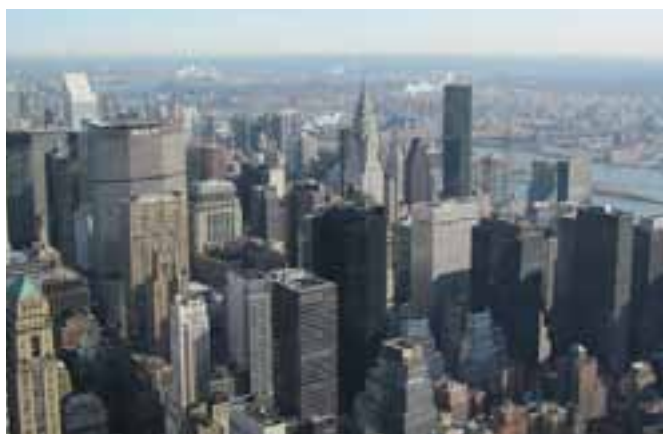
Cities like New York remain talent hotbeds thanks to cultural attractions and professional opportunity, but the competition for skilled workers is rising.

In response, many communities around the nation have already launched aggressive programs to bring in new workforce, from Alabama to Nevada to North Dakota, and the competition for top talent is getting steeper. Last August, The New York Times reported that American graduates are increasingly seeking opportunities abroad, especially in China, where unemployment remains low in skilled labor markets and entrepreneur-friendly legislation is luring people seeking opportunity in the downturn 1 .