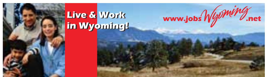
Wyoming officials had a 14' X 48' billboard displayed on the side of I-75 near Flint, Michigan, touting job opportunities in their state and promoting their web resources.

To date, more than 300 workers have been identified who relocated from Michigan to seek new opportunities in Wyoming, and that's only amongst those who have