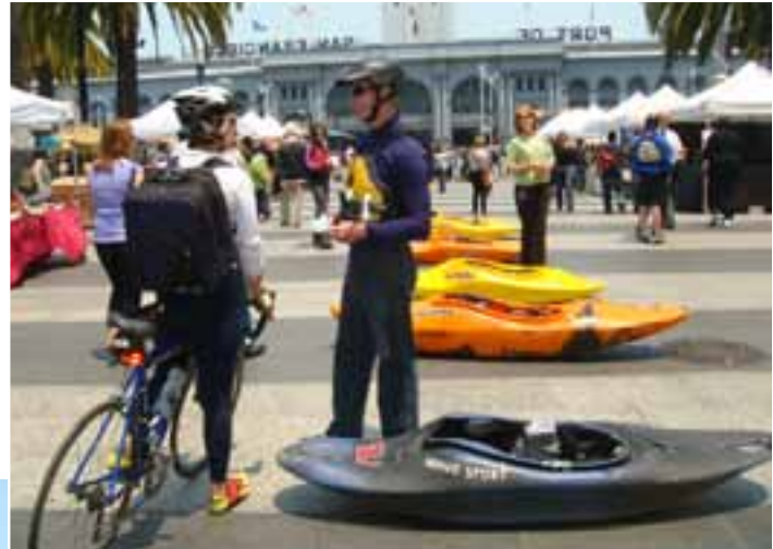
A street team decked out in "hybrid"-themed attire canvassed the streets of San Francisco to bolster attendance at Reno-Tahoe's professional recruitment event by the bay.

Additionally, EDAWN launched an efficient social media push by placing pay-per-click ads for its job fair event in San Francisco on outlets such as Facebook. The final touch was put on by a live street team promoting the event on the streets of San Francisco in hybrid attire – life vests and mountain climbing helmets on top and business suits on the bottom – to attract additional attendees.